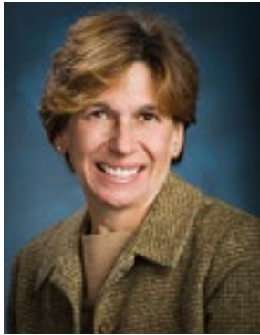
President Randi Weingarten